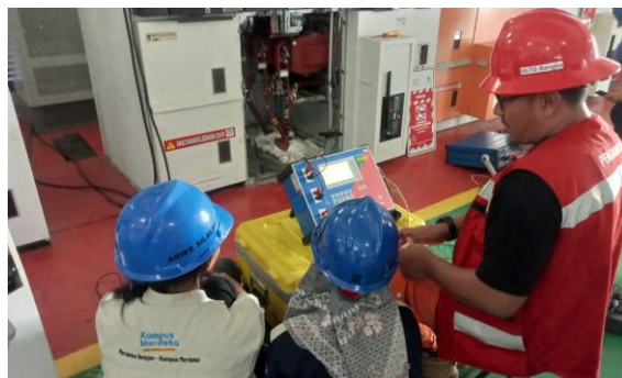
Figure 2. Measurement of ratio error and knee voltage of protection CTs

Figure 2 shows the measurement of protection CTs using a CT analyzer. The measurement results for CTs with a usage duration of 5 years are presented in Table 2, while those for CTs with a usage duration of 7 years are presented in Table 3.